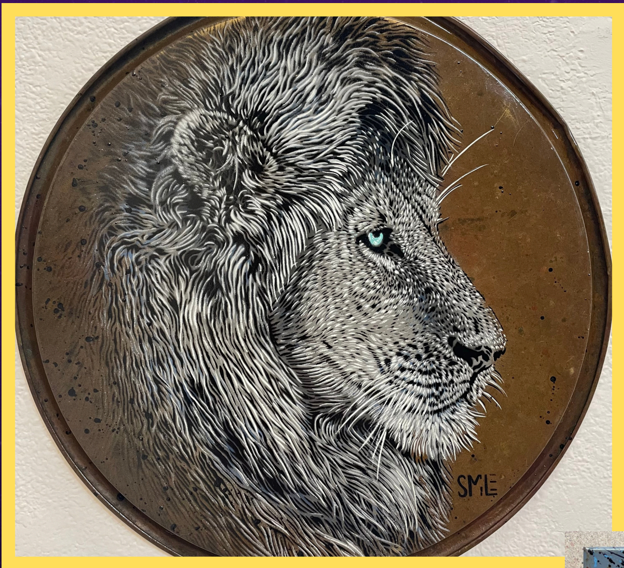
SCAR 17" round 950.00