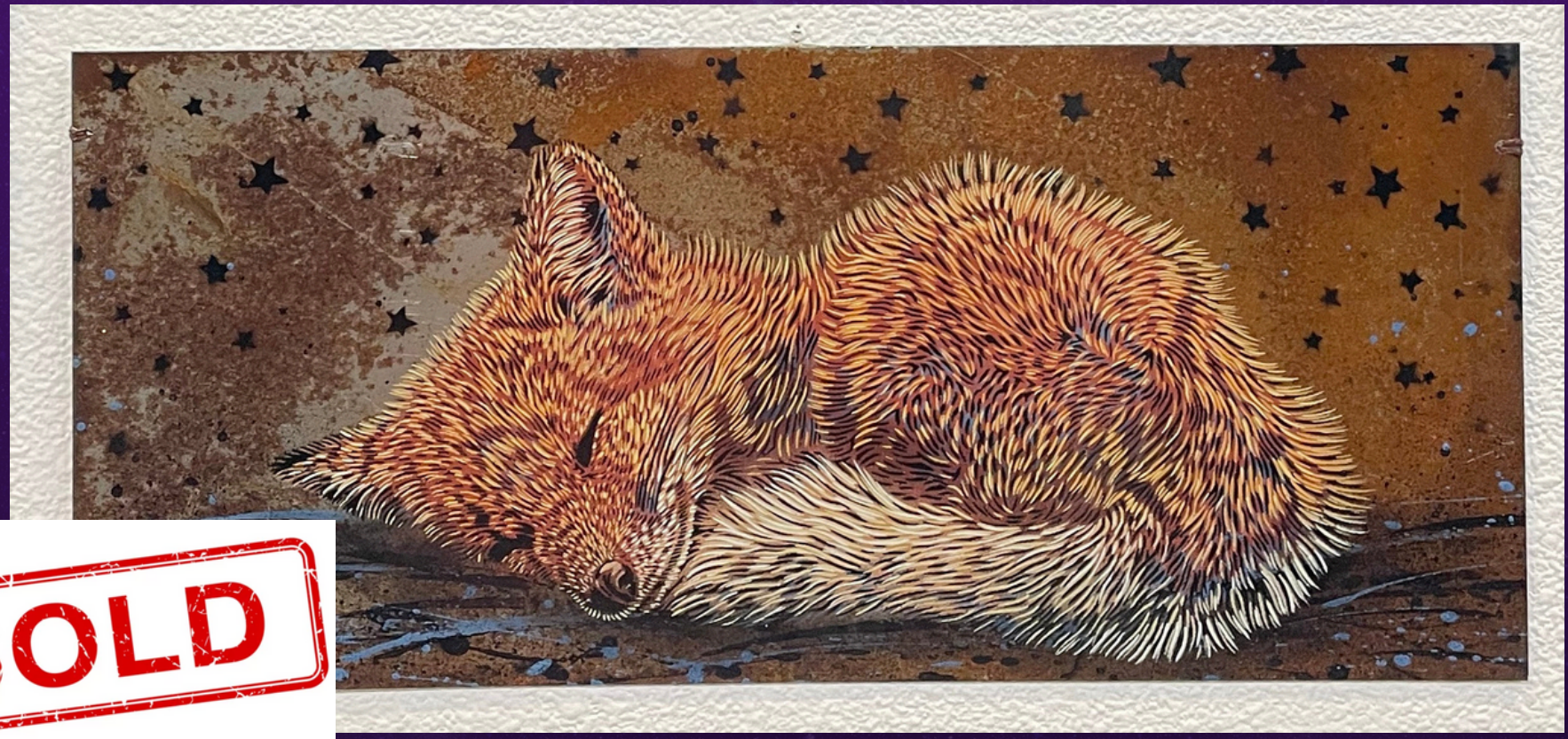
FOCUSED 20.5" x 17" 950.00