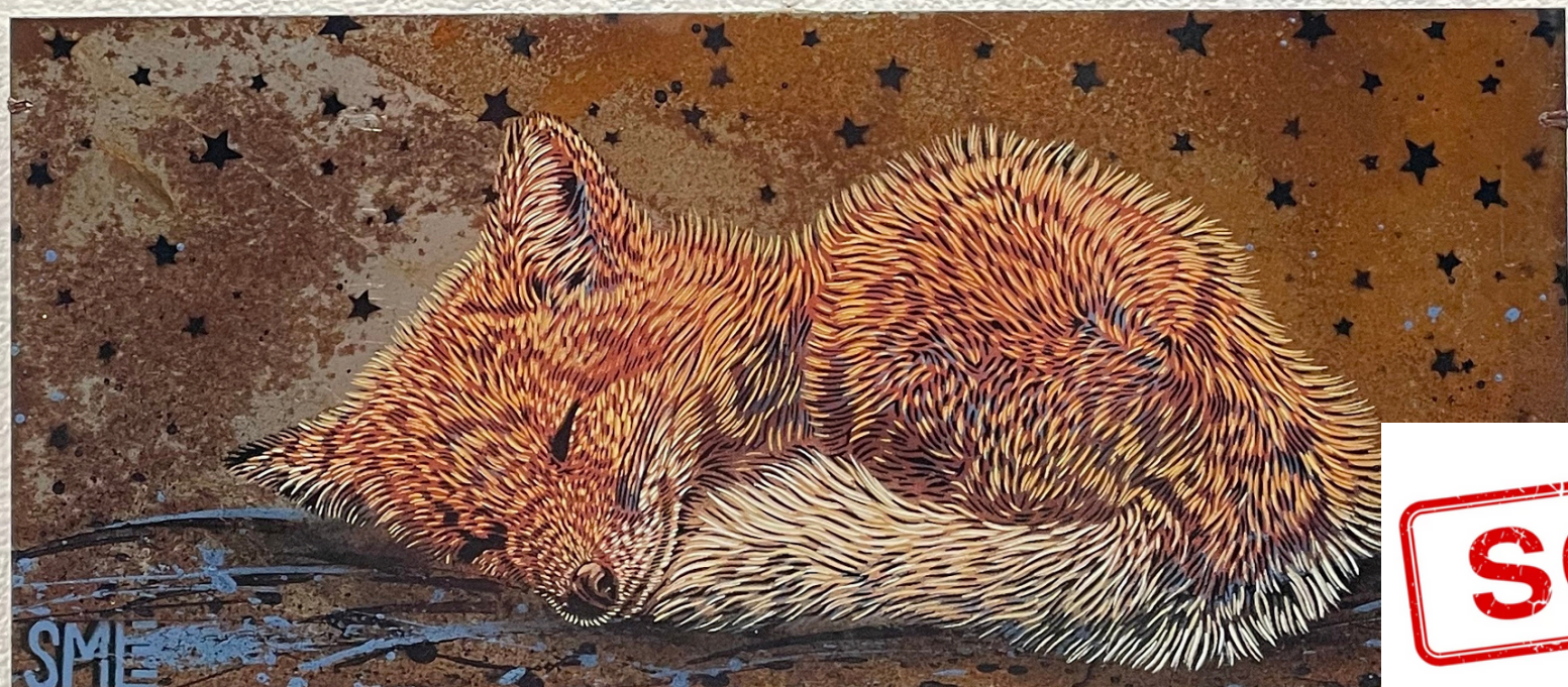
SLEEPING FOX 9" x 20.5" 950.00