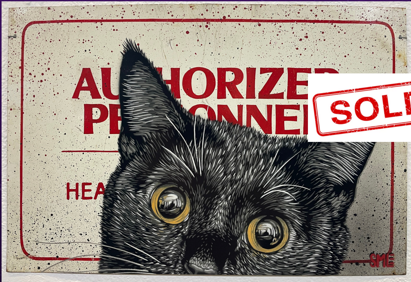
PEEKING CAT 12" x 18" 1100.00