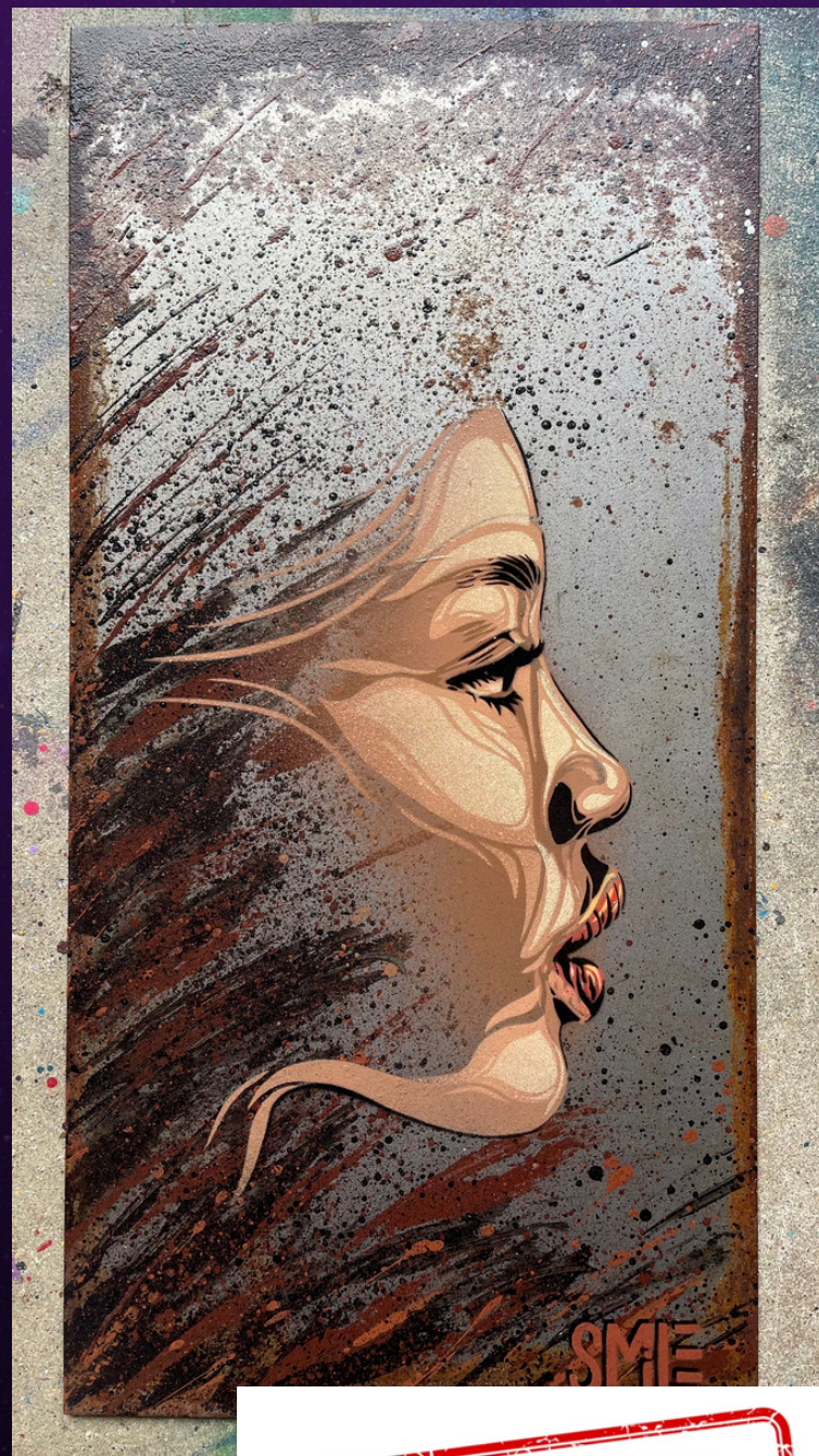
BEAUTY 9" x 18" 750.00