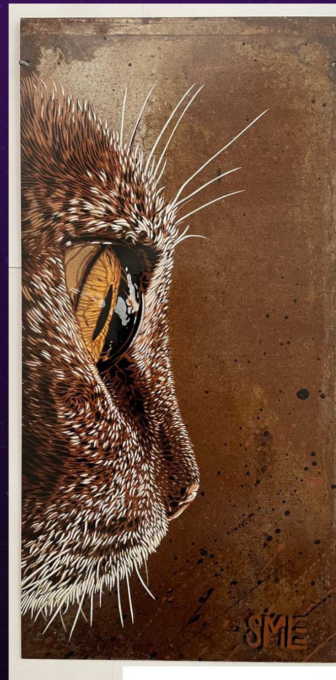
CAT EYE 9" x 18" 950.00