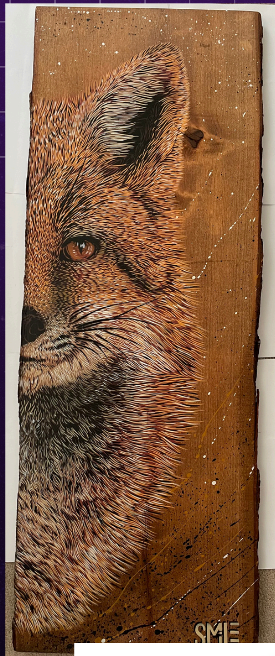
PEEKING 13" x 30" 1400.00